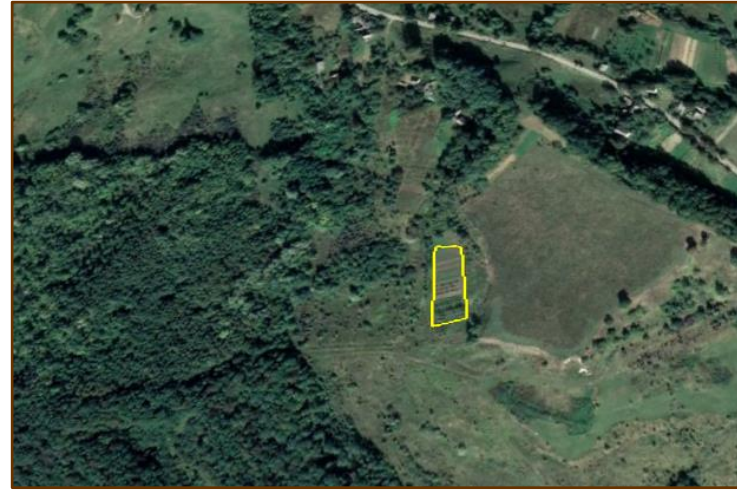
Low input apple orchard