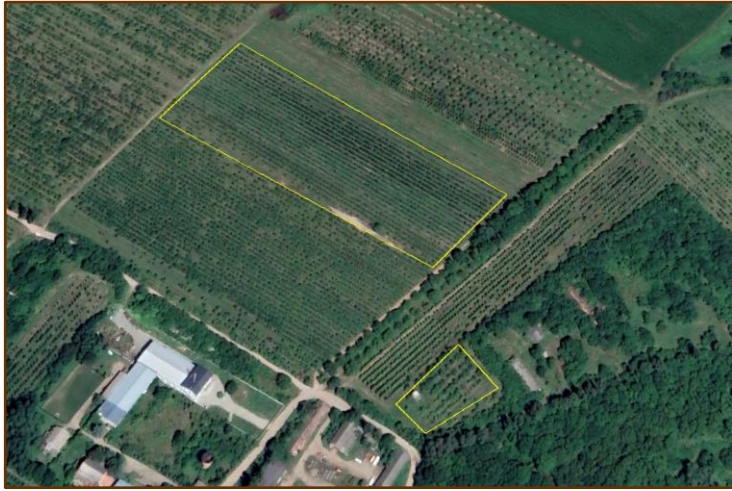
Old cherry orchard, mixed plum-walnut orchard