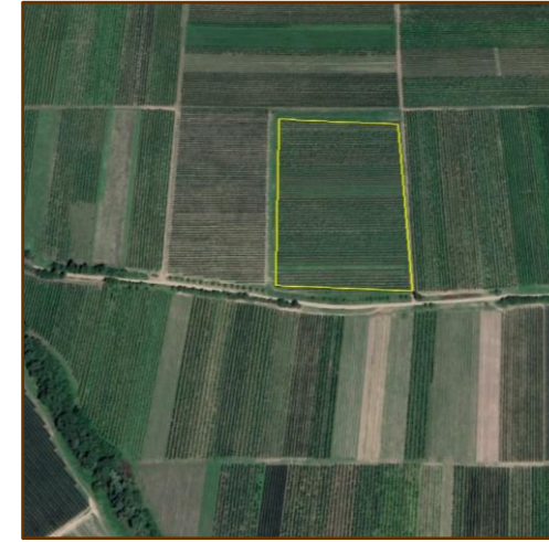
Intensive apple orchard