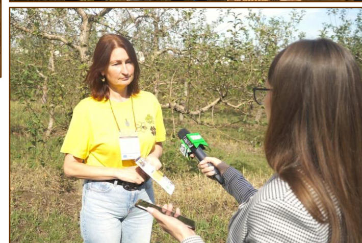
First LL Workshop Chernivtsi, September 19, 2024