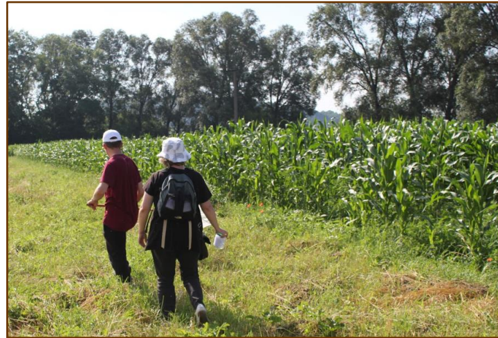
Arable crops: corn-bean, mixed farmland, old grass strips